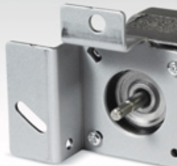
◀ Mounting Bracket