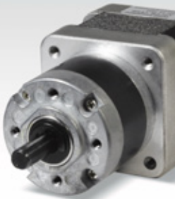
◀ Gear Box