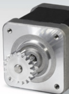
◀ Pulley & Gear