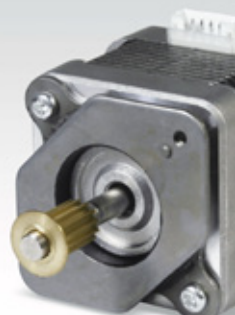
◀ Damper with Gear